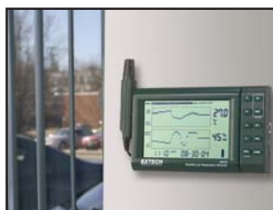
Wall mounted for storage and easy viewing of Temperature and Humidity trends with date/time stamp