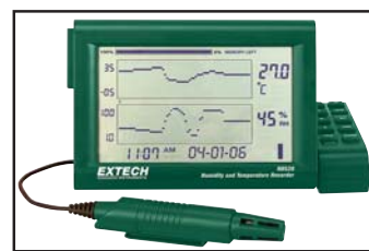
Desk mount configuration with easy to program swivel arm control panel plus probe with remote cable for reaching into ducts and humidity chambers