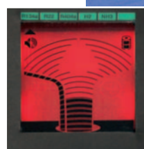
Maximum indicator shows maximum leakages