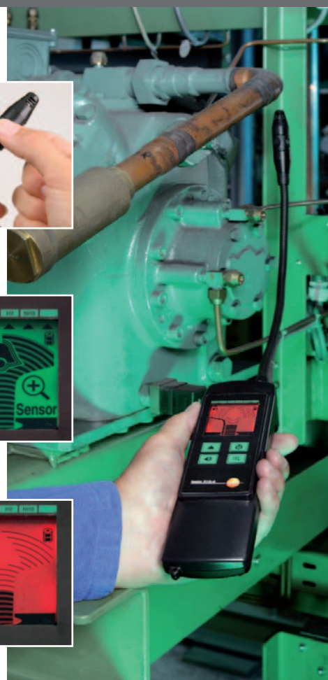
Fast and reliable detection of leakages, e.g. in refrigeration systems and heat pumps